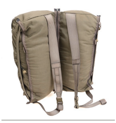
The side pockets are attached with zippers and can be removed and carried together or individually as a backpack.