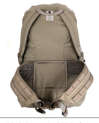
The hip belt attached high, for a short back.