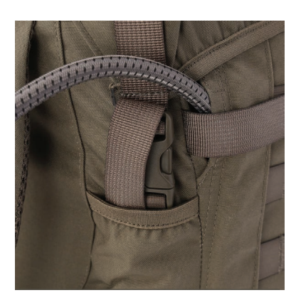
The port/opening can be used for the hose to the hydration system or for radio cables or the antenna.