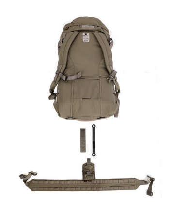
Snigels Spoon system can be used in this backpack. It gives you the possibility to use the hip belt as a combat belt and to ditch the backpack fast. Spoon sleeve, Curved long sleeve and a Spoon garage or double spoon garage.