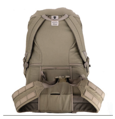
The hip belt attached low, for a long back.