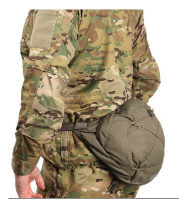
The lid carried as a hip pack.