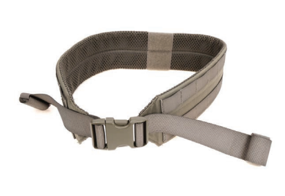
The hip belt with MOLLE webbing is shaped to fit around your hips. It has a stiff outer layer to take the weight from the backpack and a soft inner layer to be comfortable to