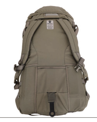
The Spoon sleeve and Curved long Spoon attached for a short/regular length back.