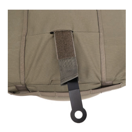
The Spoon sleeve with Curved long Spoon is inserted in the back of the backpack, in one of the slots. Adjust it to the proper height.