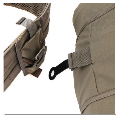
The Curved long Spoon is inserted into the Spoon garage.