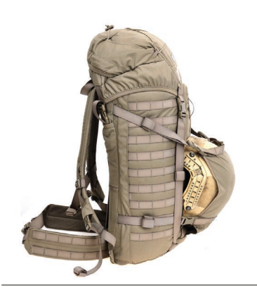
A helmet holder is placed on the back of the backpack. It can be tucked into its own pocket when not in use.