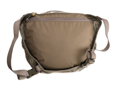
The lid can also be carried as a small back with the webbings attached as shown. It has one inside compartments with zipped opening. On the outside back there is a window for user identification.