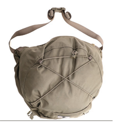
The backpack lid can be carried as a shoulder bag or around your hips. It has one outside zipped compartment.