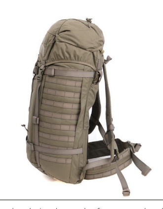
The back is shaped after your back to sit comfortably and to make it easier to carry body armour.