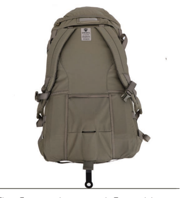
The Spoon sleeve and Curved long Spoon attached for a long length