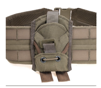
The Spoon garage/double Spoon garage is attached on the middle of the hip belt. It can also be used on any MOLLE combat belt.