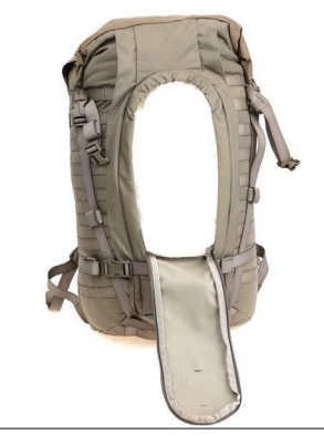
One large opening on the front of the main compartment makes it easy to access the backpack even when it is fully packed.