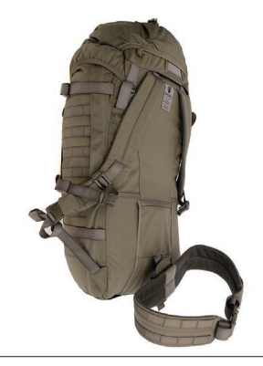
The hip belt can move with your hips and when you ditch the backpack, the hip belt with pouches stays on your body.