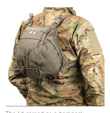
The lid carried as a backpack.