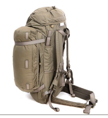
Two side pockets (26-02140A0-000) can be attached to the backpack, increasing the total volume to 75 litres.